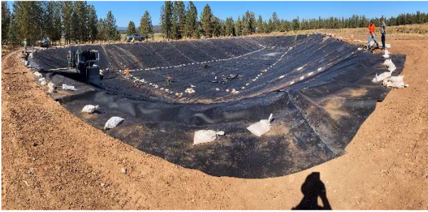
Sludge lagoon getting a new liner