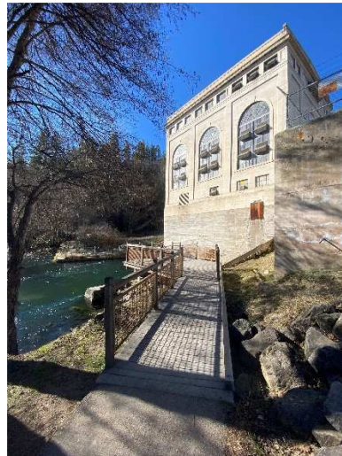
Hat Creek Powerhouse No. 2 built in 1921 and was commissioned Sept. 28, 1921

The Hat Creek is an angler's paradise. Known during the summer months to be especially popular to float from the Hat Creek Powerhouse No. 2 downstream to the Hat Creek County Park. Beautiful walking trail alongside the river which connects Highway 299E to the Hat Creek Powerhouse No. 2.