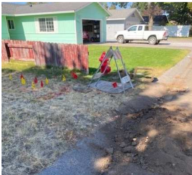
WhiteHawk Construction installing new radio read meters

PACE Engineering is working on Planning and Design of Well 9 Improvement Project located at Washburn Park. 90% design is anticipated to be complete by the end of the year, as is the funding application.