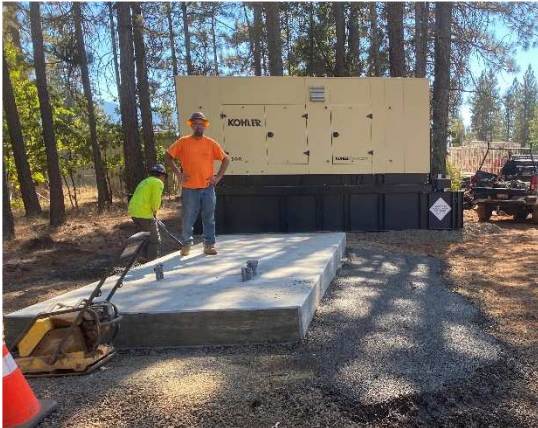
Preparing the pad for the new Generator