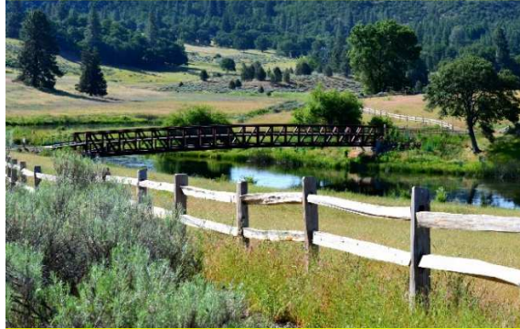
Ribbon Cutting Ceremony was held on June 19, 2018 to celebrate the opening of a new pedestrian bridge over lower Hat Creek

The Hat Creek is an angler's paradise. Known during the summer months to be especially popular to float from the Hat Creek Powerhouse No. 2 downstream to the Hat Creek County Park. Beautiful walking trail alongside the river which connects Highway 299E to the Hat Creek Powerhouse No. 2.