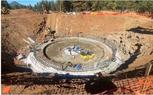
Construction of the new Clarifier